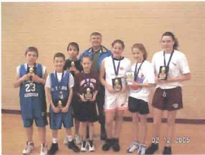
Free Throw District Champs!